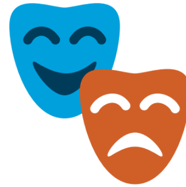
Arts & Culture