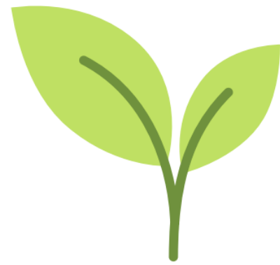
Animals & the Environment

The grant program is funded by various field of interest funds and follows the original purposes of each fund and the intent set up by its donors.